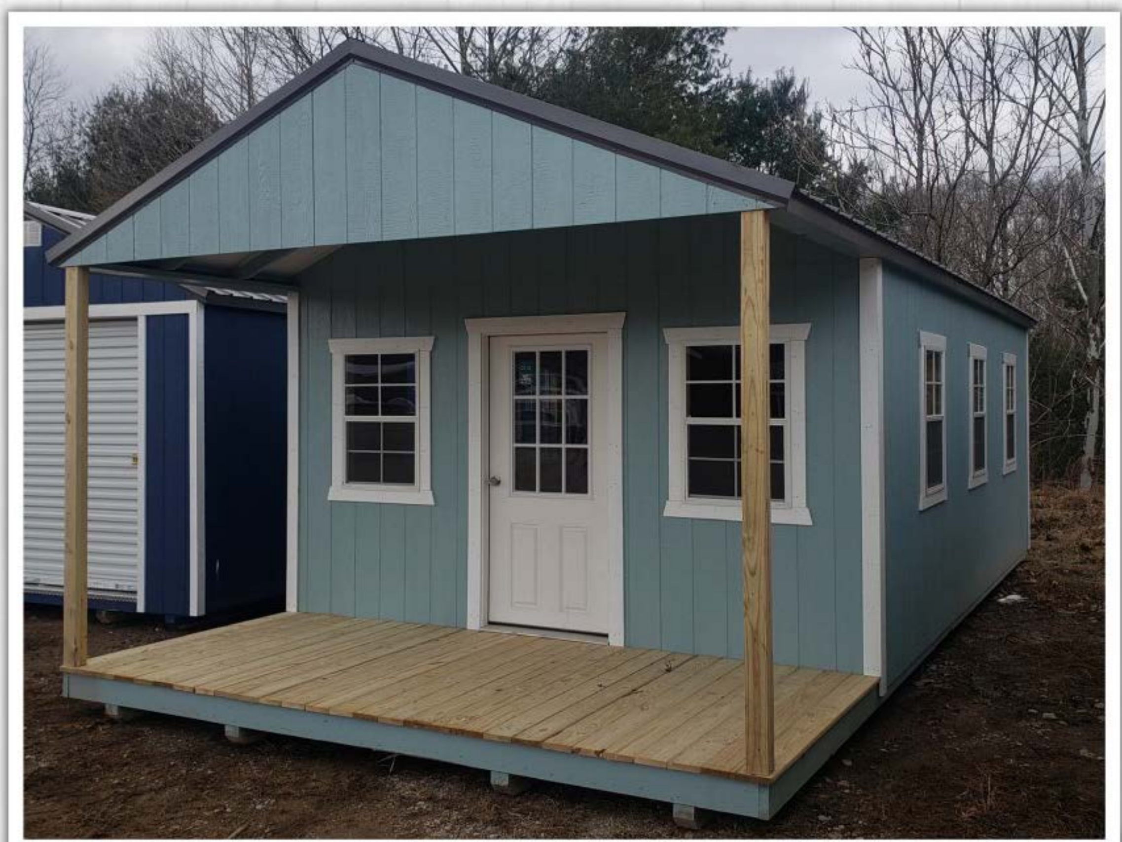
Lakeside cabin with LP Smart siding Metal roof with optional windows.