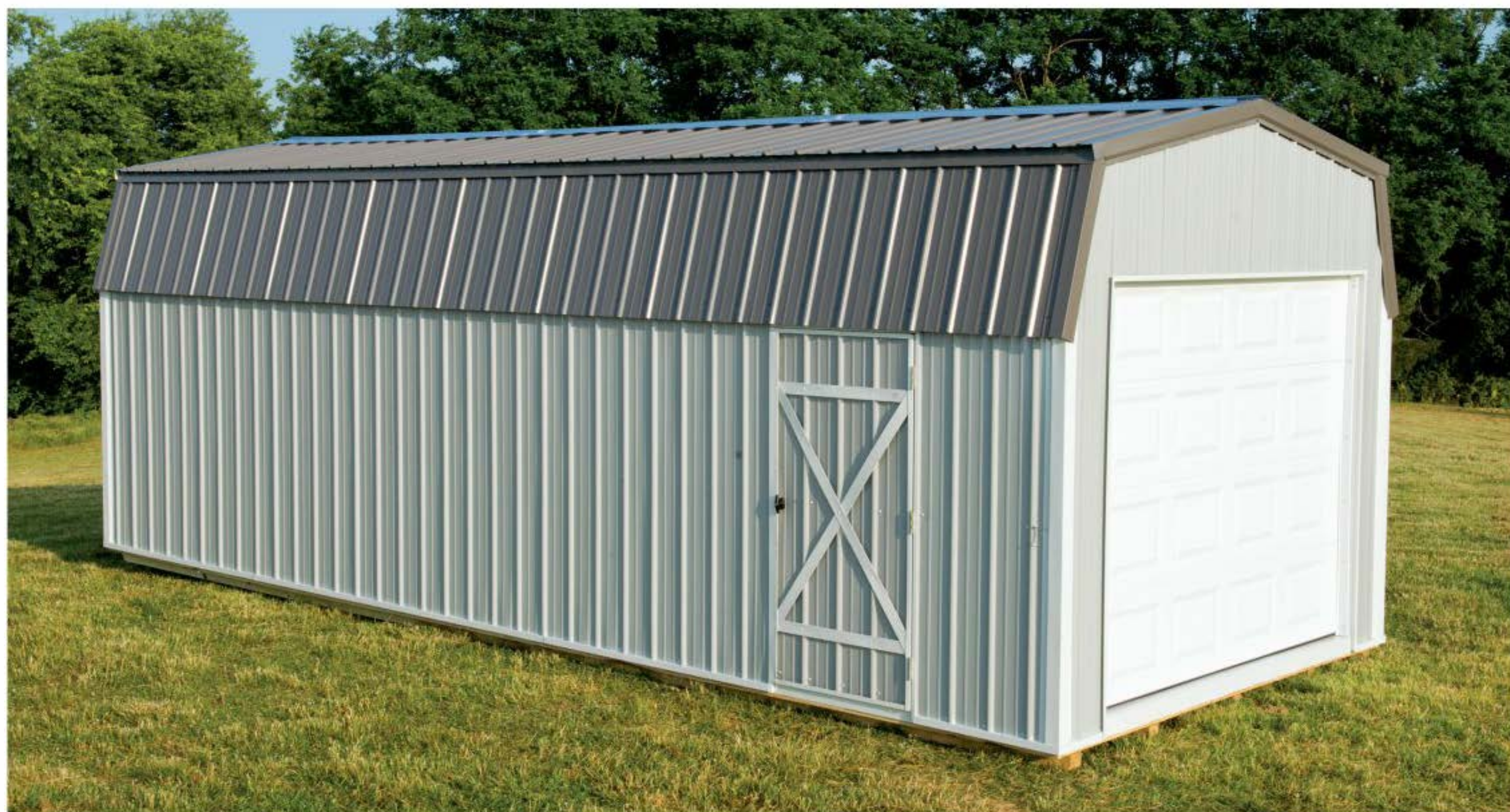
Our High Barn Style Garage shown in Metal Siding.