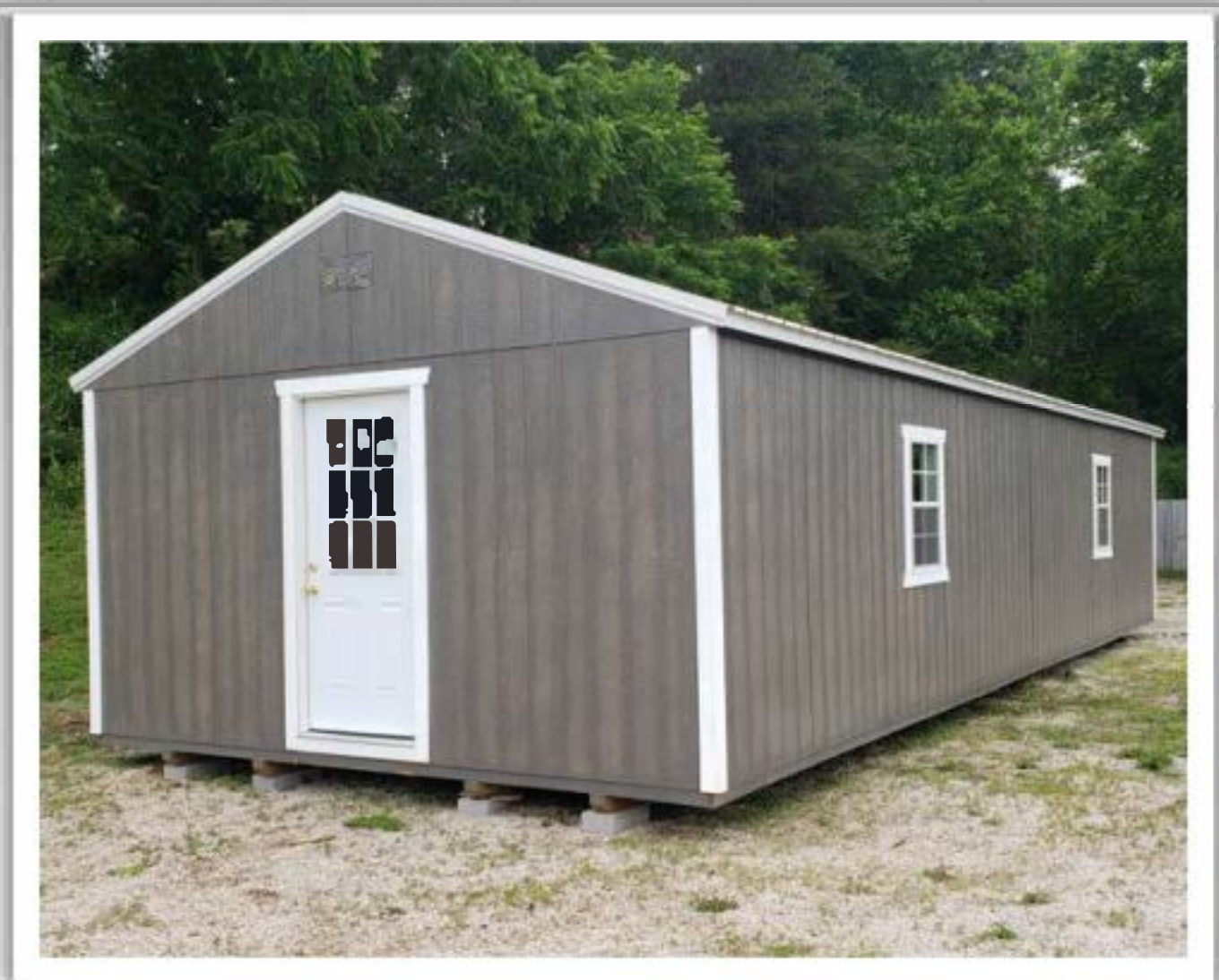
Cottage Lakeside shown in Driftwood stain.