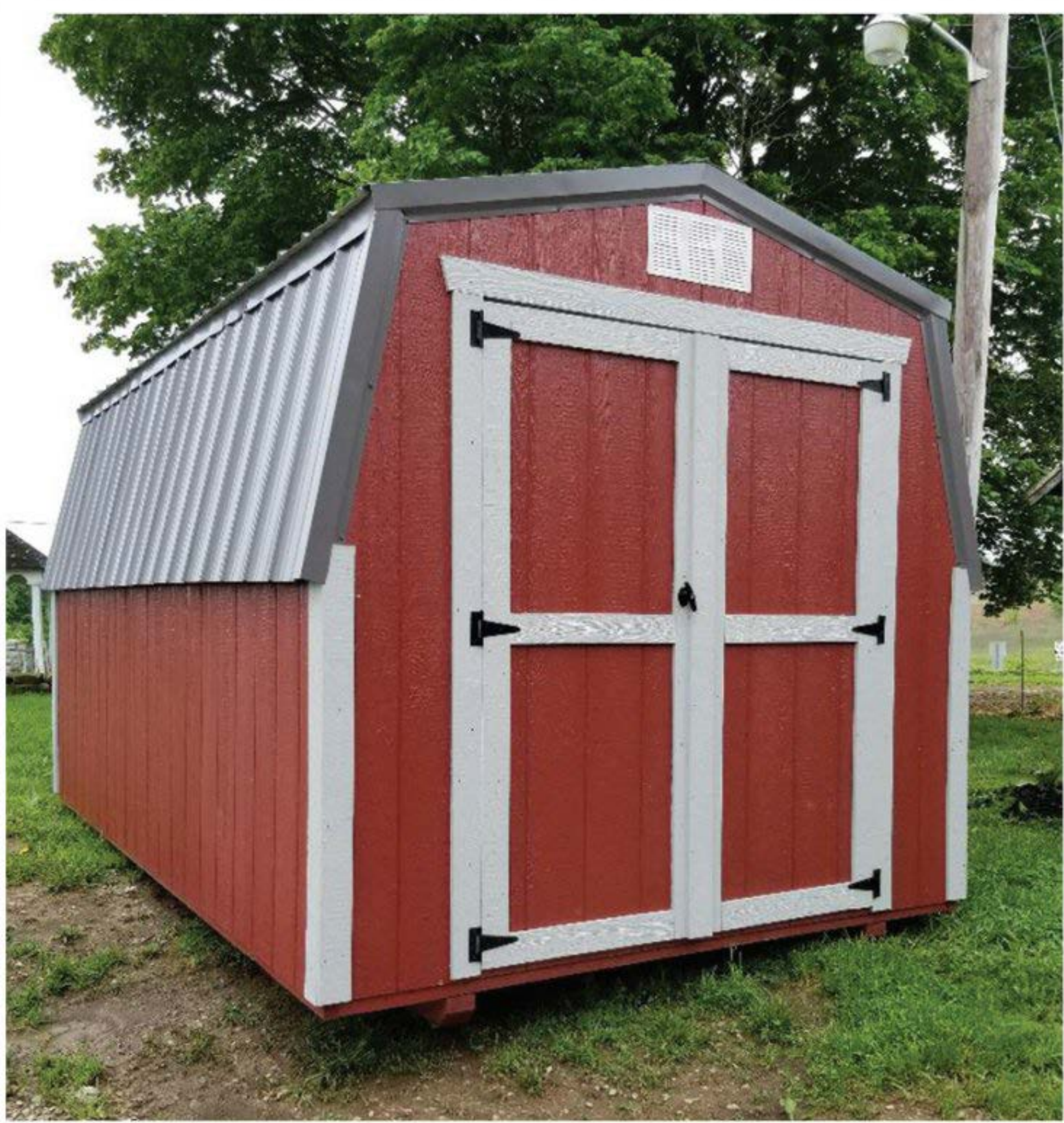
Mini Barn sample photo shows the structure in T1-11 with our standard red paint and grey trim with a grey metal roof.