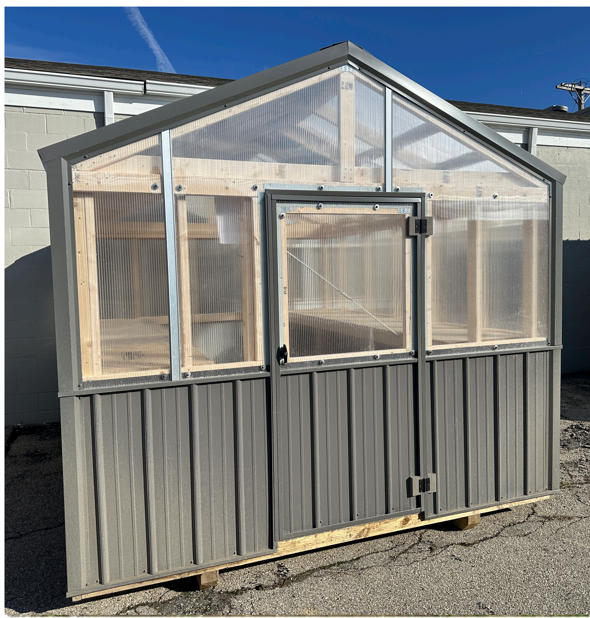
Greenhouse sample photo shows the standard layout with Burnished Slate Metal siding.