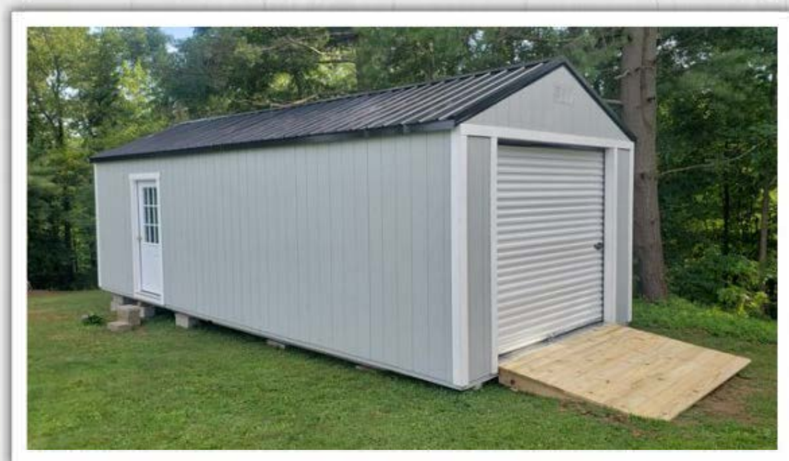
Lakeside Cottage Garage LP Smart Siding Light Gray with Black Metal Roof.