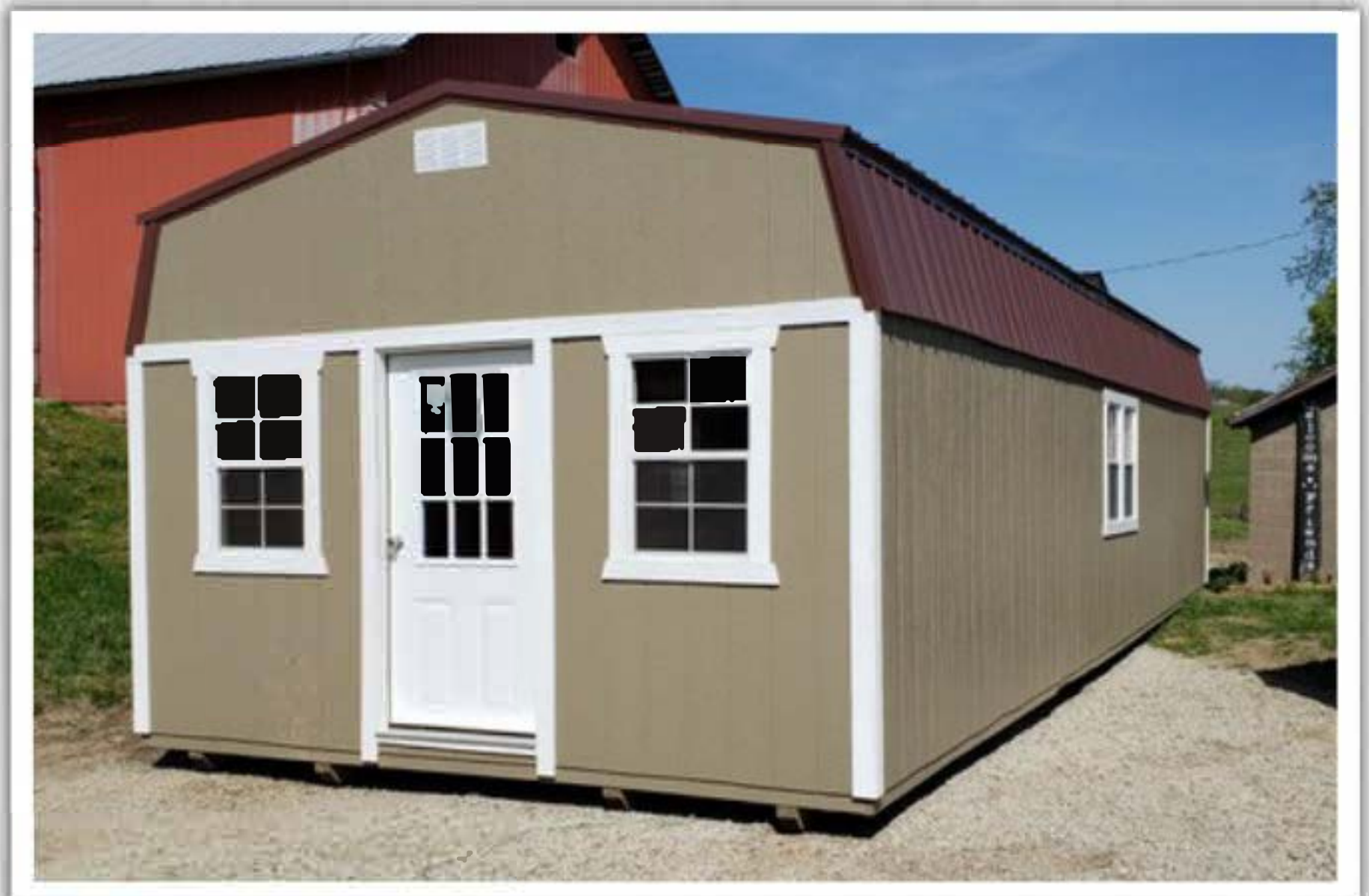
SHOWN: Lofted High Barn with optional doors and windows.