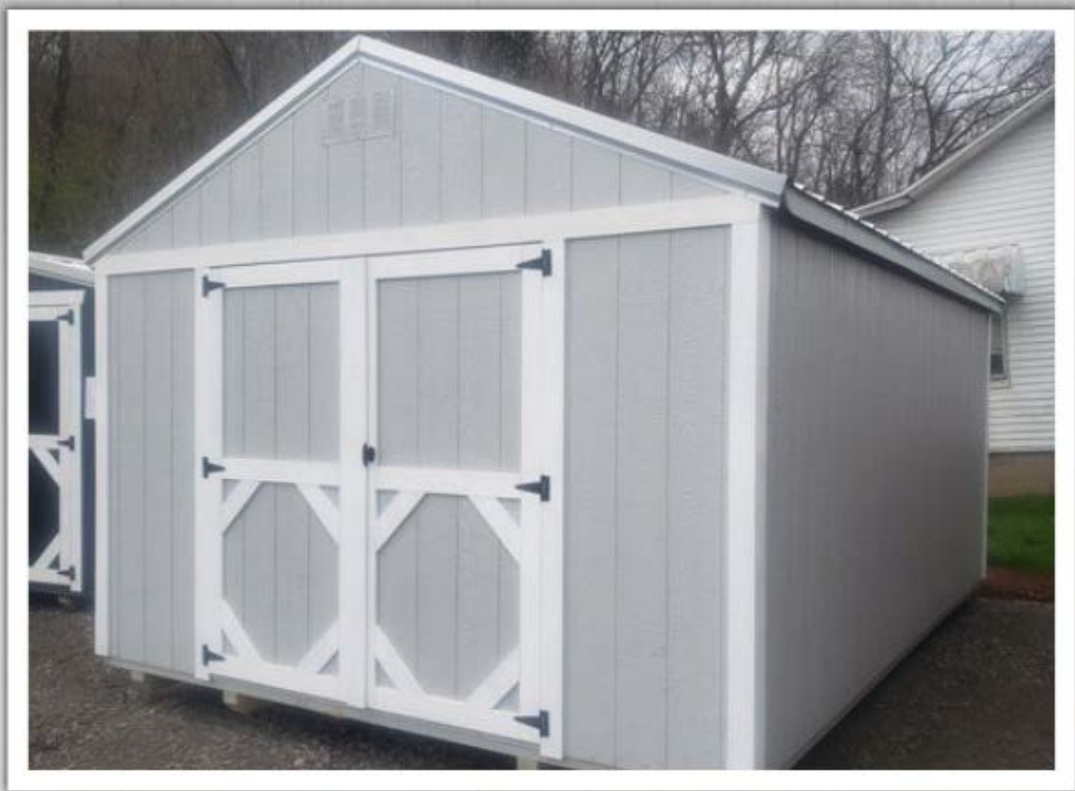
SHOWN: Deluxe Cottage with LP Smart Siding Light Gray.