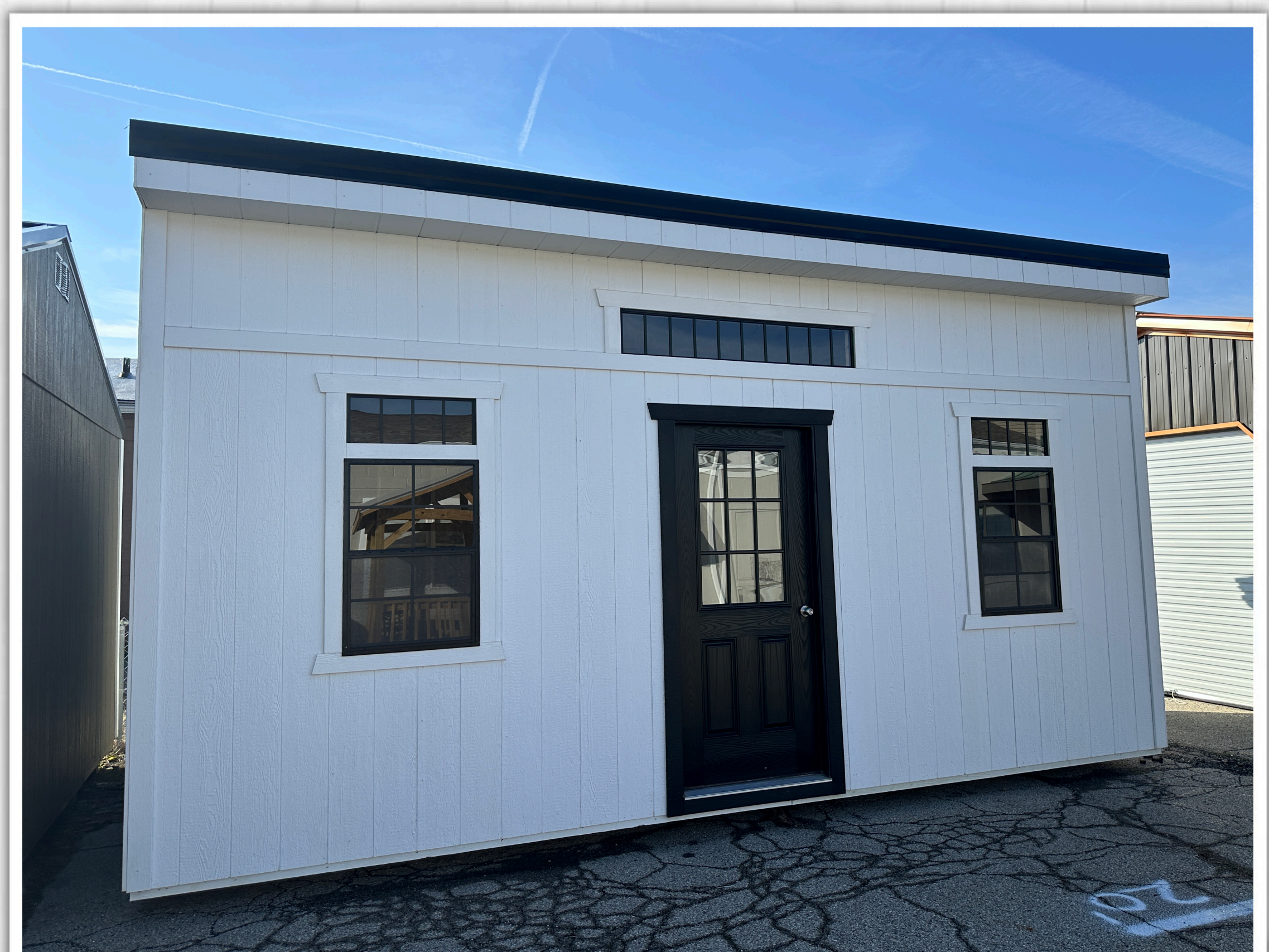
Big Sky model with White LP siding and Black metal roof. Standard layout shown