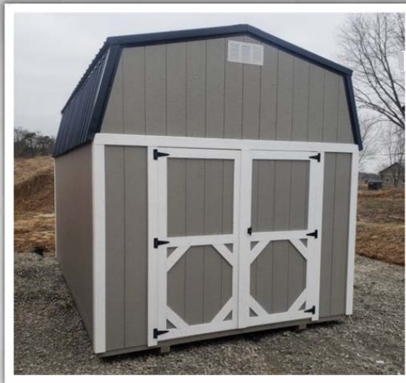
SHOWN: Standard Lofted High Barn.