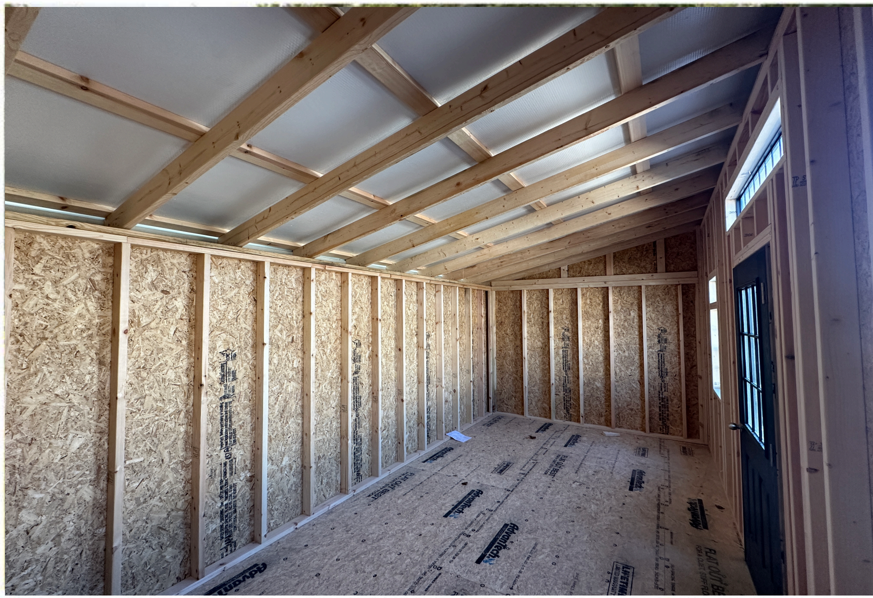
Big sky single slope includes moisture barrier in the ceiling and a large open interior space.