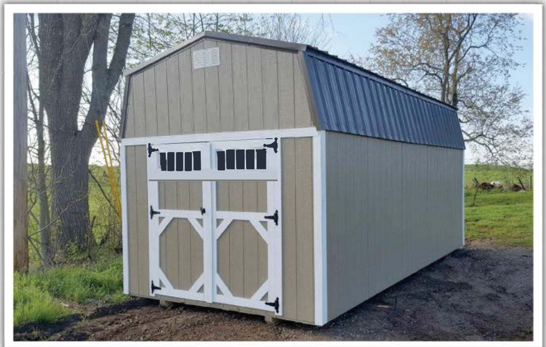
SHOWN: Lofted High Barn, Taupe with white trim, a standard feature, with two optional windows.